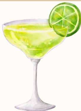
Regular or Tamarind Margarita Tequila, lime juice or tamarind and ginger