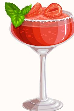
Strawberry or Mango Daiquiri Rum or Vodka, strawberry or mango puree